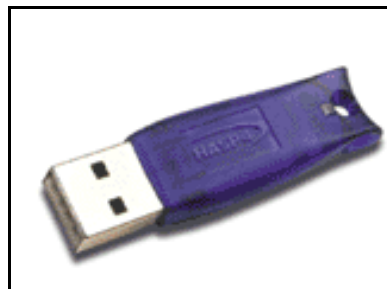
USB port dongle

If the dongle is not present on your computer, the software will run in "demo" mode and some functions will not be available.